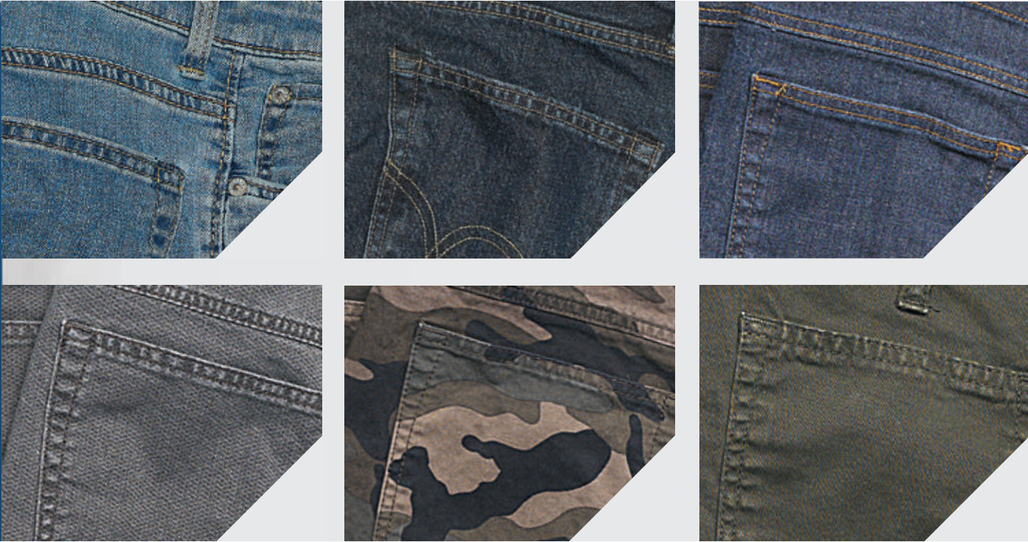
DENIM TREATED WITH NEXTONE

Washing with stones in classic way means, costs of product, of water treatment, of energy, of deterioration of washing machine and it means not a costant result of every load.