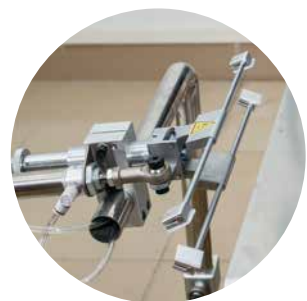
Auto collecting jig.