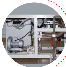
Adjustable suction motor is suitable for different thickness of fabric, and prevent movement between layers.