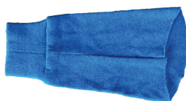
Finished Sleeve after Attaching Rib Cuff

For attaching rib cuffs on knit shirts and pants. Reducing sewing operators' skill dependency through digitally controlled operations..