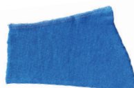
Sleeve Before Attaching